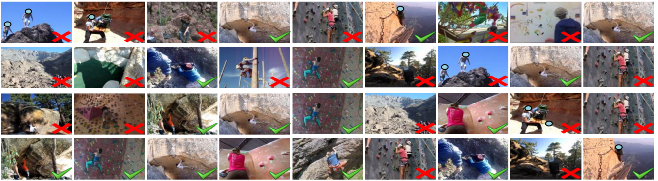
Figure 3: Top ranked videos for the event Rock climbing . From top to below are retrieved videos by selected concepts vocabulary, bi-concepts vocabulary, OR-composite concept discovery and the proposed method in Equation (4). True/false labels are marked in the lower-right of every frame.

are given with ground truth annotation (provided officially by NIST) at video level for 20 event categories, such as “Cleaning appliance”, “Renovating home” and “Dog show”. We use the official test split released by NIST, and following the standard in MED [TRECVID, 2013], we evaluate the classification accuracy using the mean Average Precision (mAP).