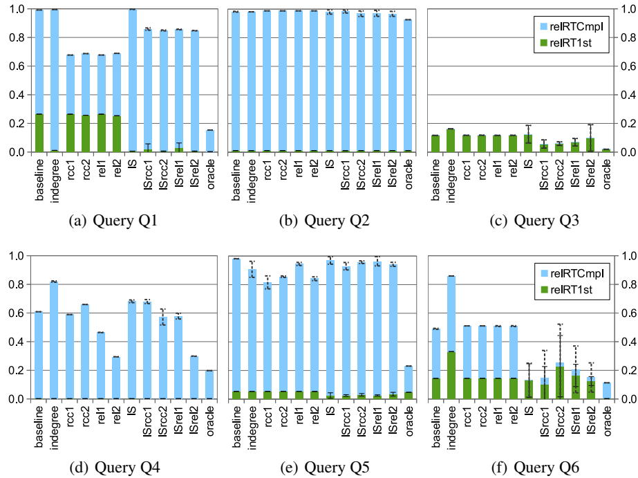
Figure 2. Relative response times for queries Q1 to Q6 over test Web W_{test}^{62,47} as achieved by employing the different approaches to prioritize URI lookups.

Another general observation is that, by using different URI prioritization approaches to execute the same query over the same test Web, the number of intermediate solutions processed by our system can vary significantly, and so does the number of priority changes initiated by the adaptive approaches. These variances indicate that the amount of computation within our system can differ considerably depending on which URI prioritization approach is used. Nonetheless, in all our experiments the overall time to execute the same query over the same test Web is always almost identical for the different approaches! This fact again illustrates the dominance of the data retrieval fraction