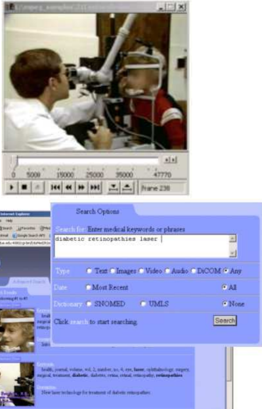
Figure 1. Content-based access control for streaming video.

An example application is shown in Figure 1. In the top image, a patient’s face is blurred during streaming since the user is not authorized to view it. The client interface to the VDBMS medical video library is shown in the bottom image. The client generates the access control query based on the user’s authorization level.