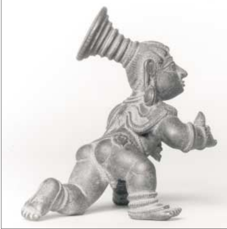
Plate 2: Epitome of childhood. Copper alloy statue of the infant Lord Krishna, circa 16th. Century, Chola–Vijayanagar transition (from the Ramachandran Collection).