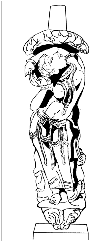
Plate 9: The exaggerated, unnatural languorous pose of a celestial nymph, her various curves creating effects such as 'grouping' and 'closure'. A visual metaphor is set up, between her youthful fertility and the fertility symbolized by the curved bough above her. The effect is mesmerizing. (Redrawn from Gods, Guardians and Angels , Asia Society Museum of San Francisco.)