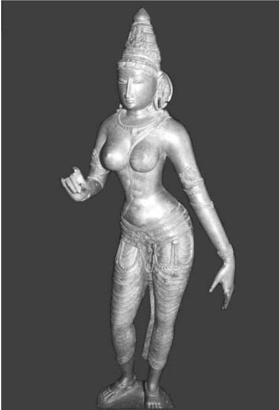
Plate 1: A copper alloy statue of the Goddess Parvathi from the Chola period circa 11th. Century AD (Ramachandran collection). What is unique about this sculpture is that it is not only sensuous and alluring but is also the very epitome of feminine grace, poise, and dignity — combining the seemingly antithetical elements of sexuality and spirituality in a single exquisite masterpiece.