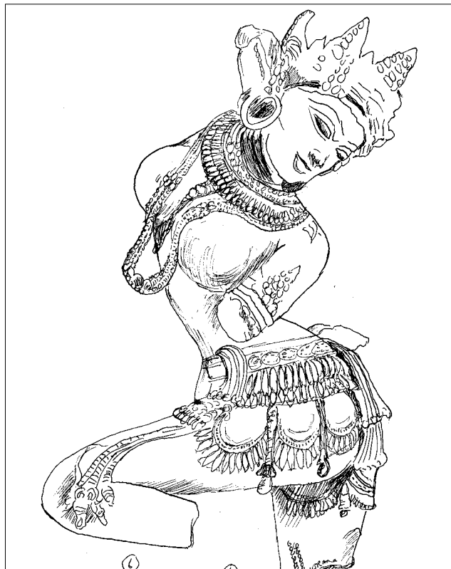
Plate 6: An apsara or nymph twisted into an anatomically impossible but aesthetically pleasing posture. Redrawn by Ramachandran from Fig. 44, Arts of South and South-East Asia , Metropolitan Museum of Art, New York.)