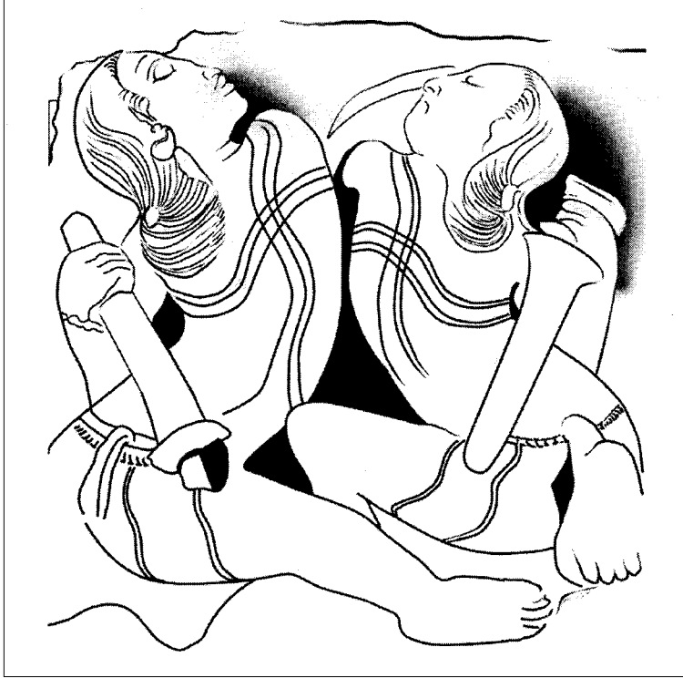
Plate 5: Celestial nymphs.