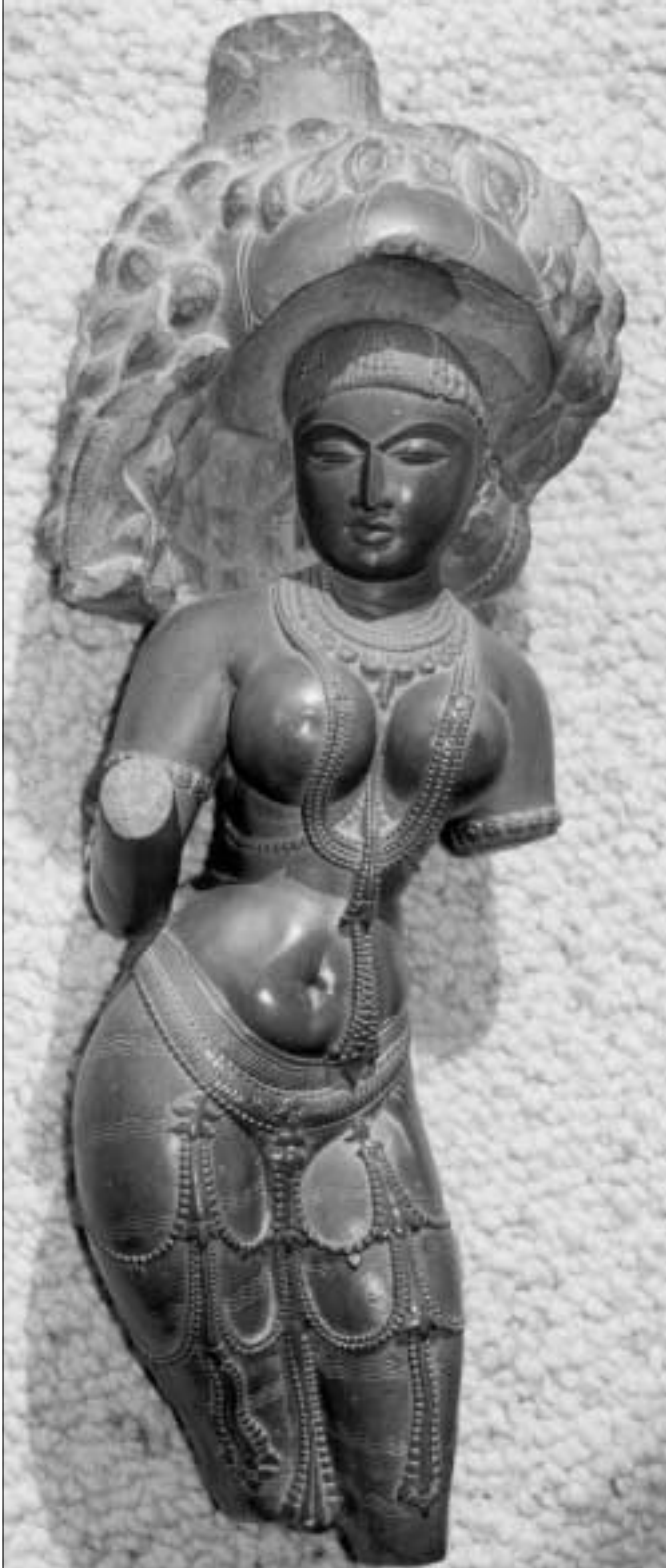
Plate 4: A celestial nymph — the rasa of feminine perfection. (Mathura, 800 A.D.). Notice the clever use of abdominal creases and dimples produced by subcutaneous fat — a feminine secondary sexual characteristic. (Replica in Ramachandran Collection.)