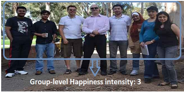
Figure 1: The figure shows a sample image from the GReco sub-challenge. For representation purposes the group has been enclosed in a rectangle and the score value = 3 is the group-level happiness intensity.

shows. The intent is to add more spontaneous data to the EmotiW benchmarking effort. The new sub-challenge added this year is the automatic group-level emotion recognition, which is based on the HaPpy PeoplE Images (HAPPEI) database [4].