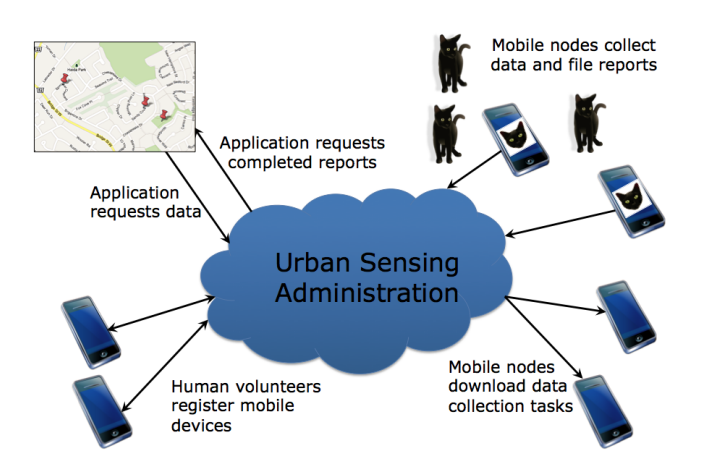
Figure 1: Generalized Urban Sensing Architecture.

We list a set of goals for NotiSense, and later use them to evaluate our design.