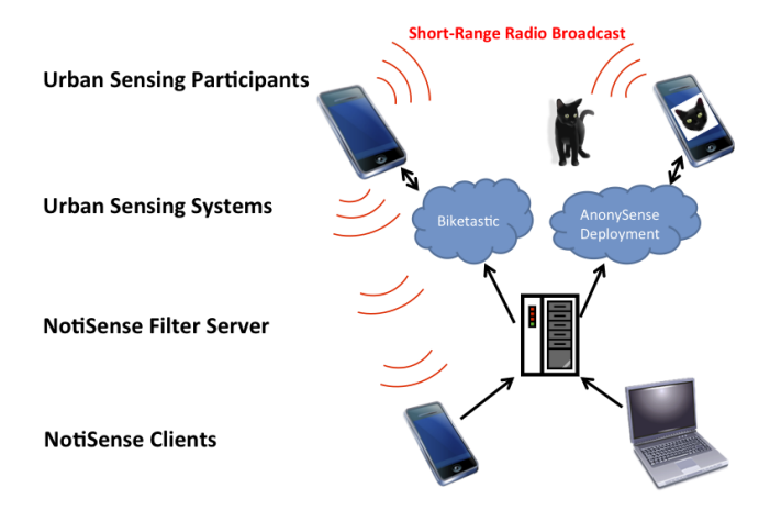
Figure 2: NotiSense's system architecture.

As shown in Figure 2, NotiSense adds three important components to a traditional urban sensing architecture. NotiSense relies on metadata from urban sensing systems, which is collected from urban sensing tasks and consenting urban sensing participants. Since the raw metadata from many urban sensing systems could be too large for mobile devices to periodically download, NotiSense clients rely on filter servers to avoid transferring entire data sets. Finally, some urban sensing participants broadcast short-range wireless signals that are identifiable by NotiSense clients. We discuss below how this architecture can meet our goals.