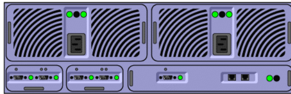
FIGURE 1 T3WG (Single Brick)

In partner group configurations, one controller unit is referred to as the “master,” while the other controller unit is called the “alternate master.” Both units function essentially the same for application host I/O requests. The master unit has the additional responsibility of providing the TCP services included with the array and acts as the management interface for the pair. The T3ES offers the advantage of cache mirroring and multi-path support over the T3WG, eliminating the controller as a SPOF to provide a fully redundant storage solution.